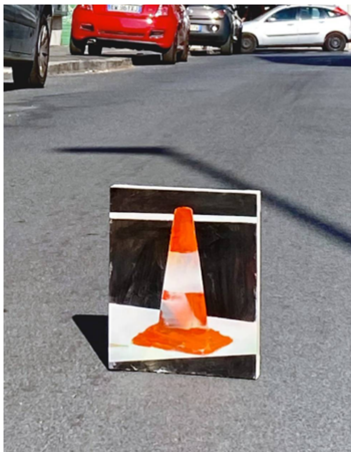
Senza titolo, 2022 - Luca De Gregorio