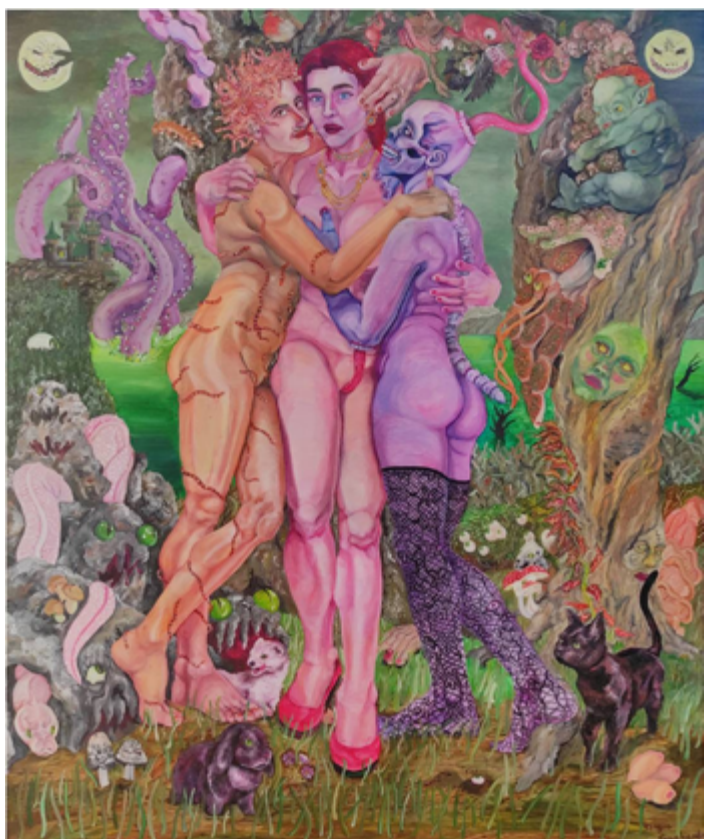
La cupidigia, 2020 - Sergio Gagliardo