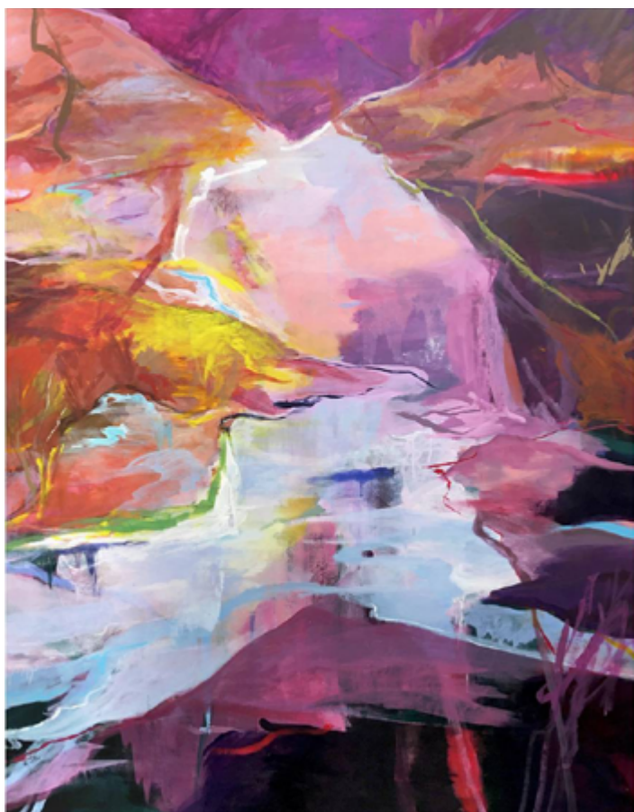
Lontano [emersione], 2022 - Alice Papi